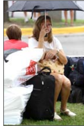
Count on hot weather. Count on heavy lifting. Count on an air thick with excitement.