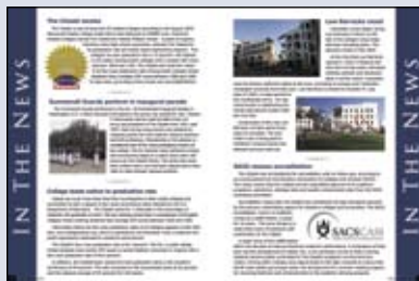
In The News ..... 4 by the Public Affairs Office