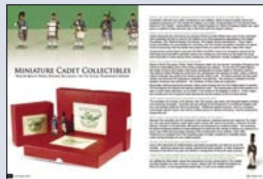
Miniature Cadet Collectibles ..... 56 by Jarret Sonta