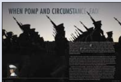
When Pomp and Circumstance Fade ..... 28 by Cadet Tara Woodside, '08