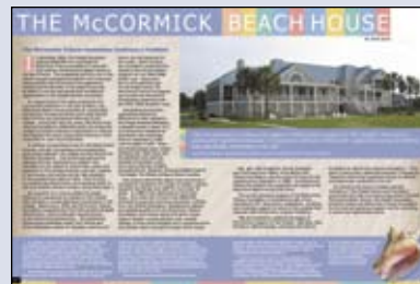
The McCormick Beach House ..... 54 by Jarret Sonta