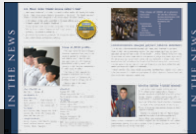
In the News by the Public Affairs Office