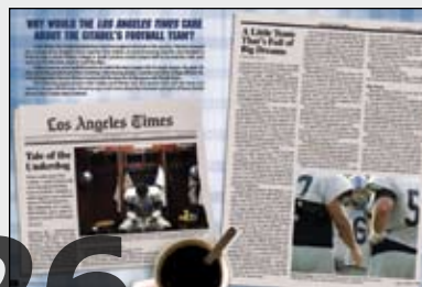
Tale of the Underdog by Drex Heikes