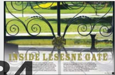
Inside Lesesne Gate by Russell Pace