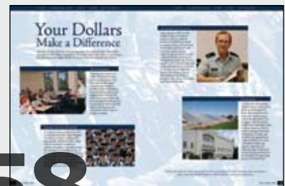
Your Dollars Make a Difference by Jarret Sonta